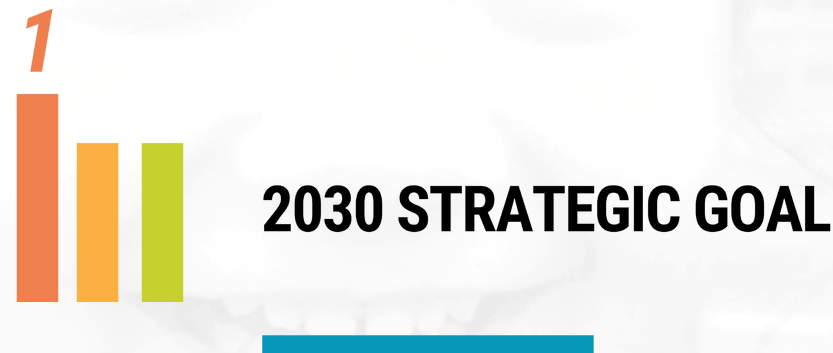
Goal 1: One Million Home Repairs

We will make more than one million repairs for homes and families in need.