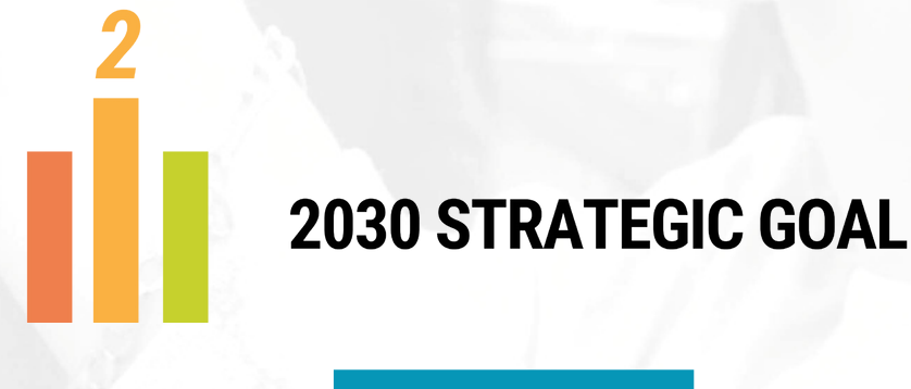
Goal 2: People-First

We will continue to emphasize and prioritize anti-racist, people-first community-oriented services.