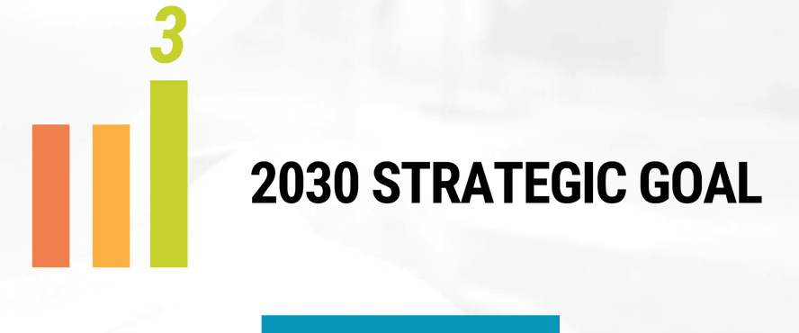
Goal 3: Life-Changing Services

We will provide life-changing services in the top 50 strategic areas of need.